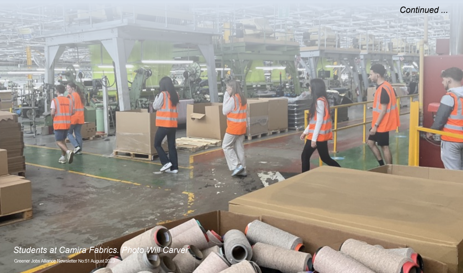
Students at Camira Fabrics.