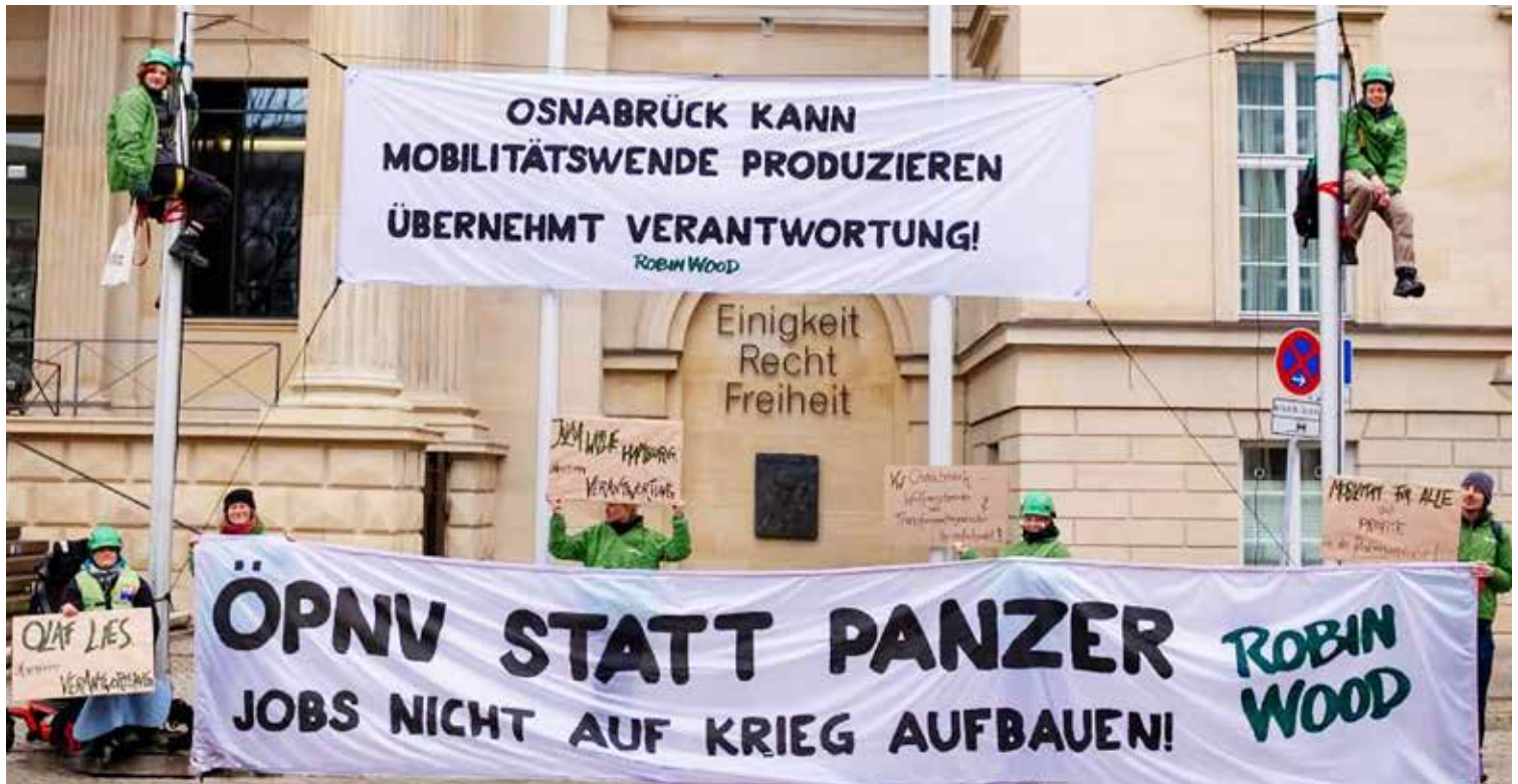
Protesters in Hanover call for VW to convert to public transport, not tanks.